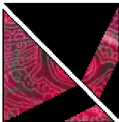
This group is ONE template